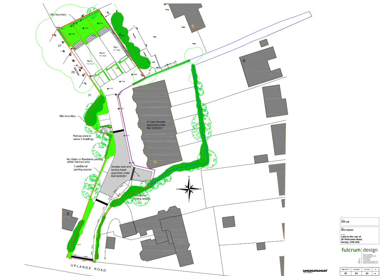
Figure 1 Proposed site plan (showing approved scheme to south)