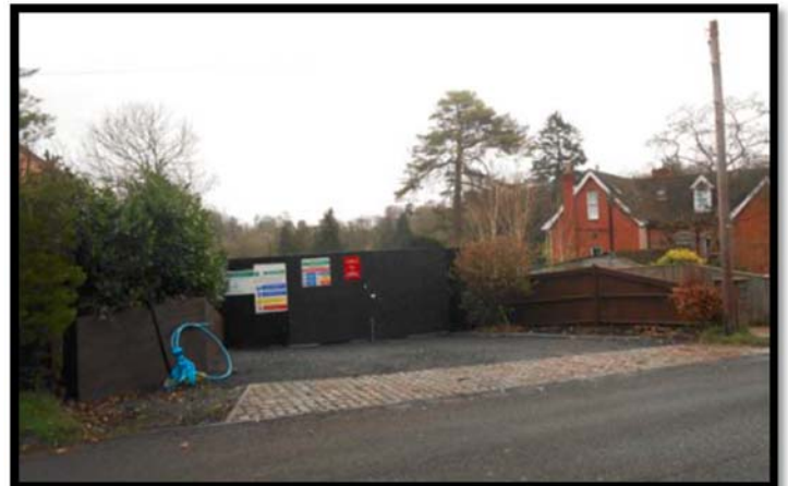
Figure 4 Photos of site access from Uplands Road.

8.9 It is proposed to erect a row of three terraced houses that are two stories with accommodation within the loft space and have a lower ground floor. They would appear from the front as two storeys with a pitched roof but from the rear as three storeys with a pitched roof. The houses would have a southerly facing frontage, facing towards the front of the site (towards Uplands Road). The proposed houses would be positioned over 80m from uplands road. Given this, and given that the dwellings would sit lower than the previously approved scheme on the site, the dwellings would sit lower than the buildings at 37-41. Given the land levels, separation distances, the proposed building would at best have a limited visual presence from Uplands Road, it would not be visually prominent. The land would be built up in parts, but this would not result in the proposal being unduly prominent.