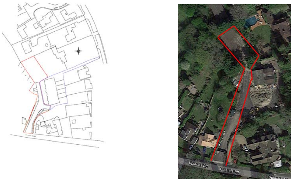
Figure 2 Existing site plan and aerial photo