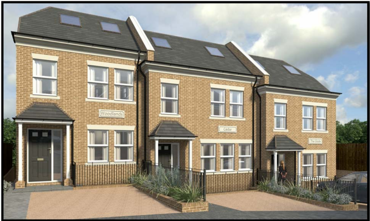
Submitted CGI detailing of the front elevation.