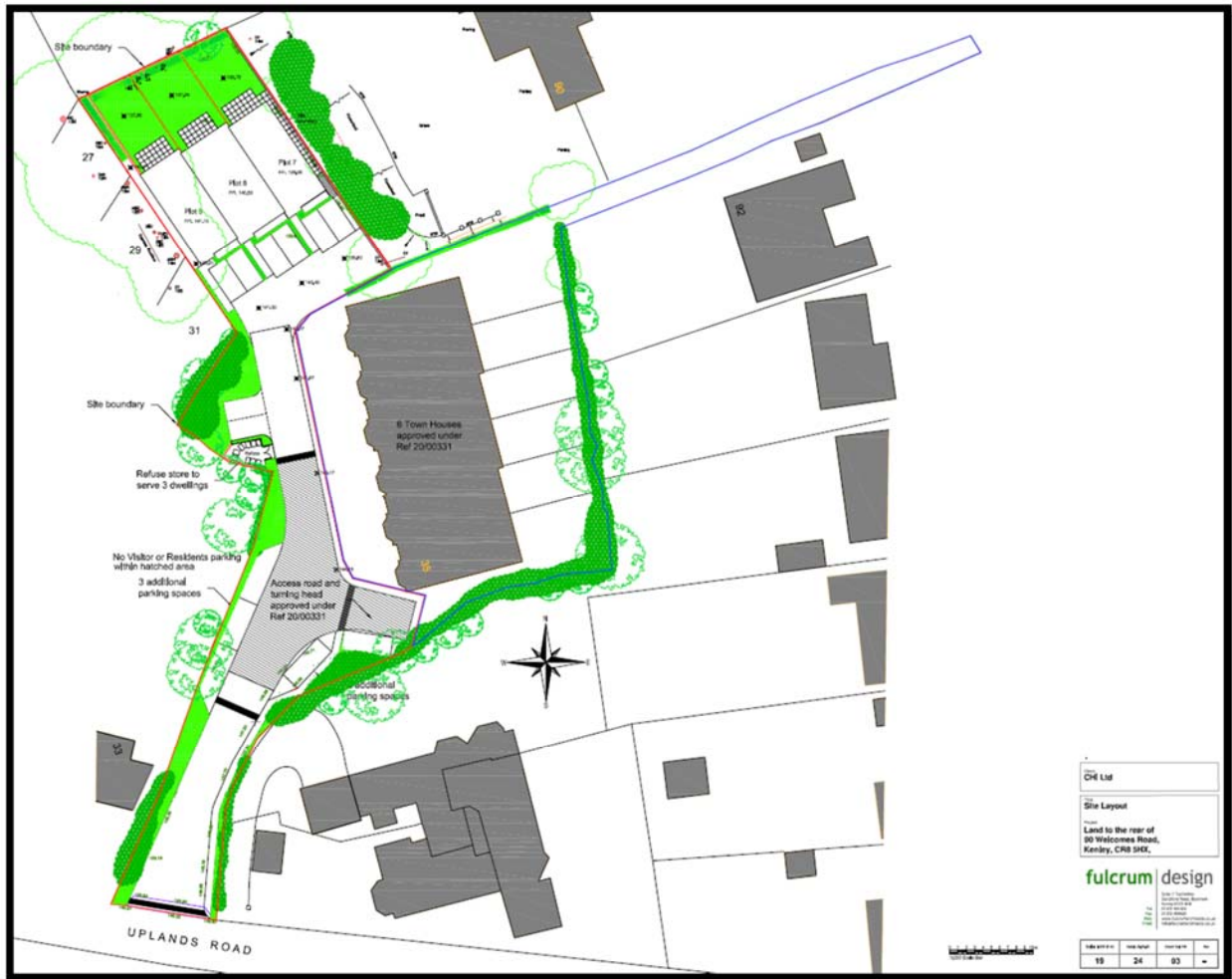
Figure 3 Proposed site layout

8.8 The site as aforementioned forms part of a site previously granted consent for residential development. The proposed development site is itself an anomaly within the wider area. The wider site is a backland location, situated behind houses that front Uplands Road and Welcomes Road, approximately 80m from the road. The land levels fall from the road level to the northern end of the site. The site has limited visibility from the public realm, with the exception of the vehicular access. It is noted that works have commenced on site for the development of the previous onsite approval for the 6 town